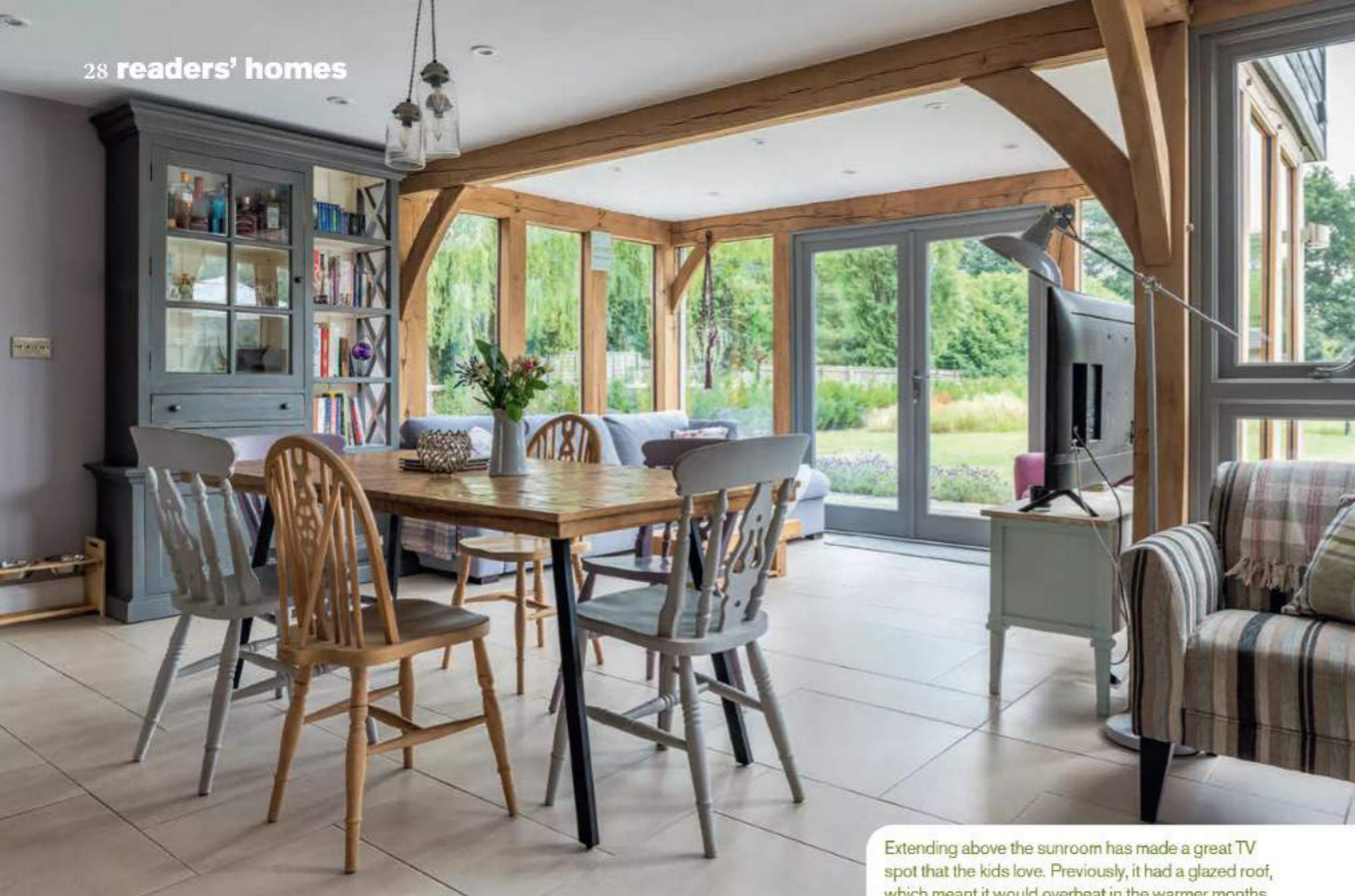
Extending above the sunroom has made a great TV spot that the kids love. Previously, it had a glazed roof, which meant it would overheat in the warmer months